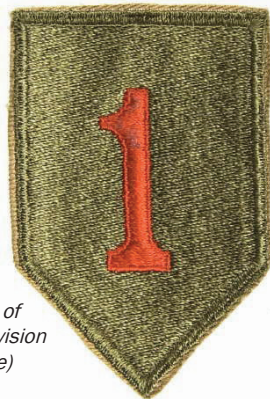
Coat of arms of the U.S. First Division (Big Red One)

Symbolic planting is under way to reconstitute the Big Red One's coat of arms. North American tree species have been used, such as red oak and sequoia. To delineate this symbol and create interaction with the visitors, a path will be laid around the plantation. This pathway can be made accessible to disabled visitors.