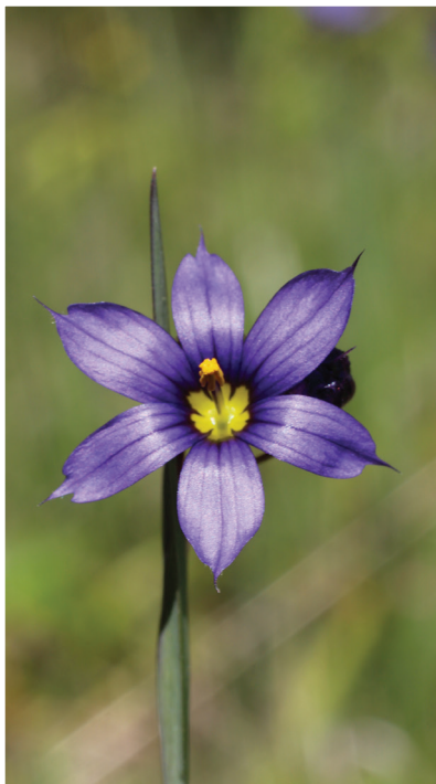
Sisyrinchium montanum (American blue-eyed grass) An emblematic flower brought by American soldiers to the battlefields